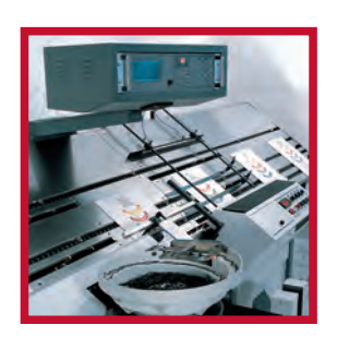
The PB-796 HD ES working with automatic 70 mm. hanger feeder.